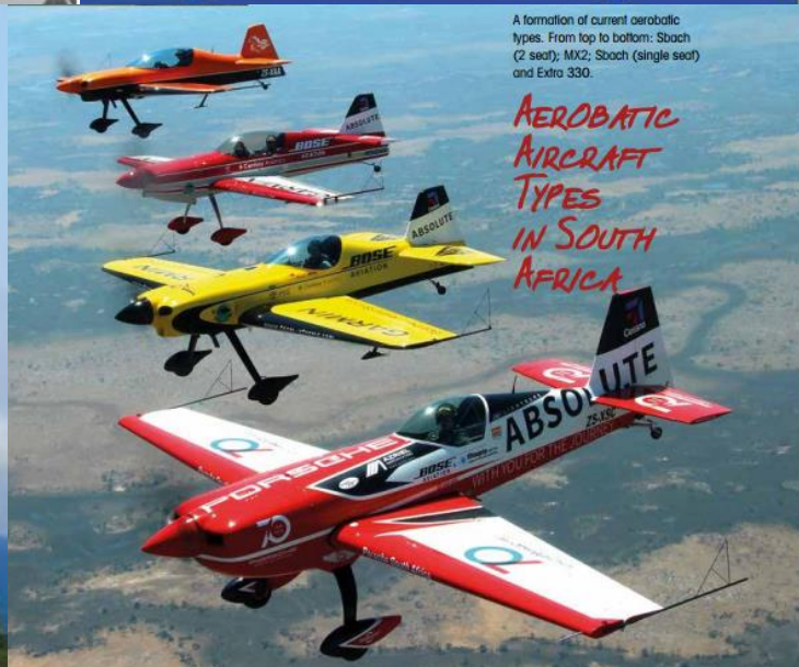
A formation of current aerobatic types. From top to bottom: Sbach (2 seat); MX2; Sbach (single seat) and Extra 330.