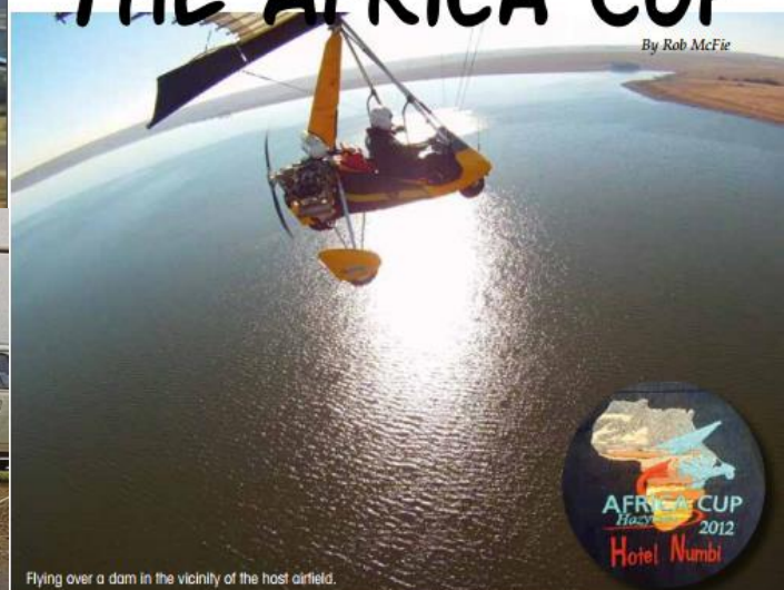
Flying over a dam in the vicinity of the host airfield.