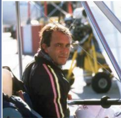
Mike Blyth who broke the world microlight altitude record in 1987 in a trike.