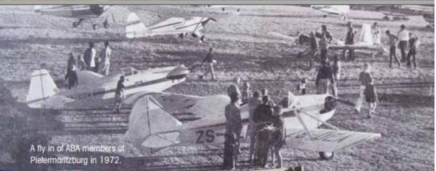
A fly in of ABA members of Pietermaritzburg in 1972.