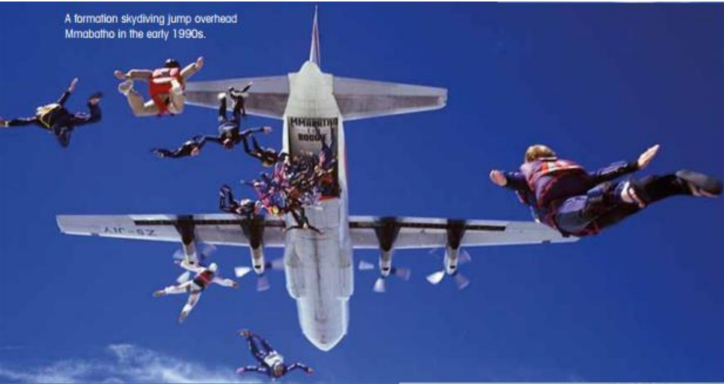
A formation skydiving jump overhead Mmabatho in the early 1990s.